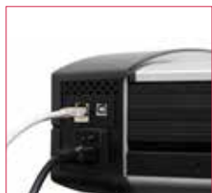
Copy to unlimited number of printers via network or USB