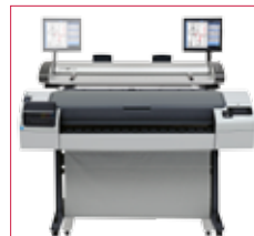
A good ergonomic environment for left- as well as right-handed operation

Contex Head Office Phone: +45 4814 1122 info@contex.com