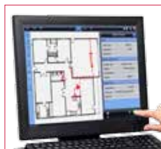
Standard Windows application or intuitive touch-screen mode