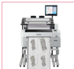
IQ Quattro 24 MFP Repro