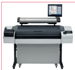
SD 36 MFP Repro

A Contex MFP Repro bundle includes a scanner, intuitive Nextimage REPRO software for scanning and copying, and a high stand. Also available with low stand for side-by-side solutions.