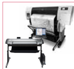
Low stand version available for side-by-side