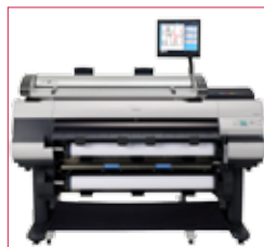
IQ Quattro 44 MFP Repro